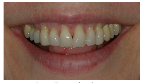
Periodontally involved recession

Most often, a loose tooth will become progressively looser and eventually fall out. This process is frequently accompanied by pain and infection.