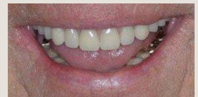
Restores smile and function